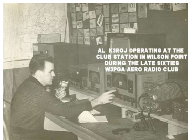
AL K3ROJ OPERATING AT THE CLUB STATION IN WILSON POINT DURING THE LATE SIXTIES W3PGA AERO RADIO CLUB