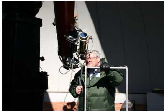
WB3FMT calibrates the optical wave receiver at The Maryland Science Center Using 301 Light St. #173 as a signal source.

The newsletter of the Aero Amateur Radio Club